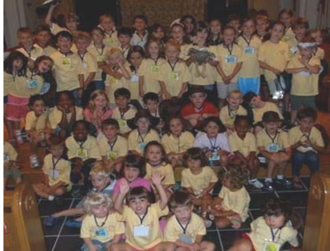
Over sixty children participated in Vacation Bible School '09

God also asks us to play our part in supporting His kingdom. At the Eucharist each Sunday, the offering is made and the priest recites the following words from the Old Testament: "All things come of thee O Lord, and of Thine own have we given thee..." (1 Chronicles 29:14). The Stewardship Committee asks each of us to prayerfully consider God's guidance of a tithe as