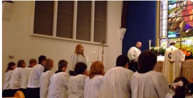
The Altar at Easter